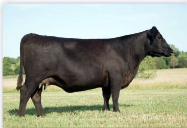
MILL BRAE PW JOANIE 8223