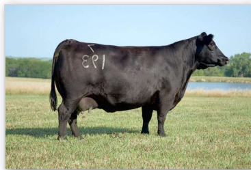
MILL BRAE PW BLACKCAP 7193