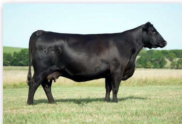
EWA 658 OF 3114 MOMENTUM