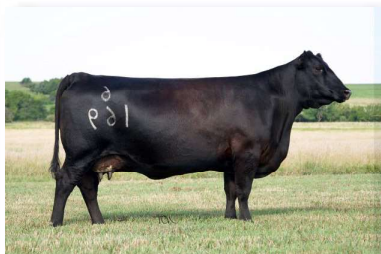
MILL BRAE COM BLACKCAP 6169

Built on honesty, integrity and hardworking cattle powered by a maternally efficient cowherd with exceptional udder quality, calm dispositions, and sound foot structure; traits we value and critically assess along with a complement of balanced EPDs.